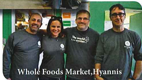
Whole Foods Market, Hyannis