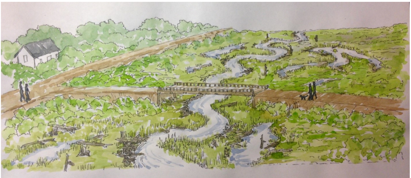
Figure 2: An example of a rendering of a retired cranberry bog that has been ecologically restored with habitat details including large wood to provide habitat for a variety of wildlife, channel bed geometry, micro-topography, recreational opportunities, and natural vegetation.

Seeking public opinion about the project was not part of this application. However, the project was reviewed by the Harwich Youth & Recreation Commission and received unanimous support. Please see letter of support attached.