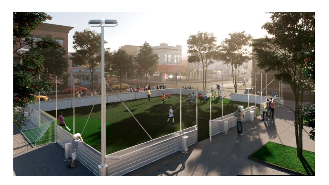
Dual Pitch, Turf, Lights, Bleachers, Observation/DJ/Storage, Surface