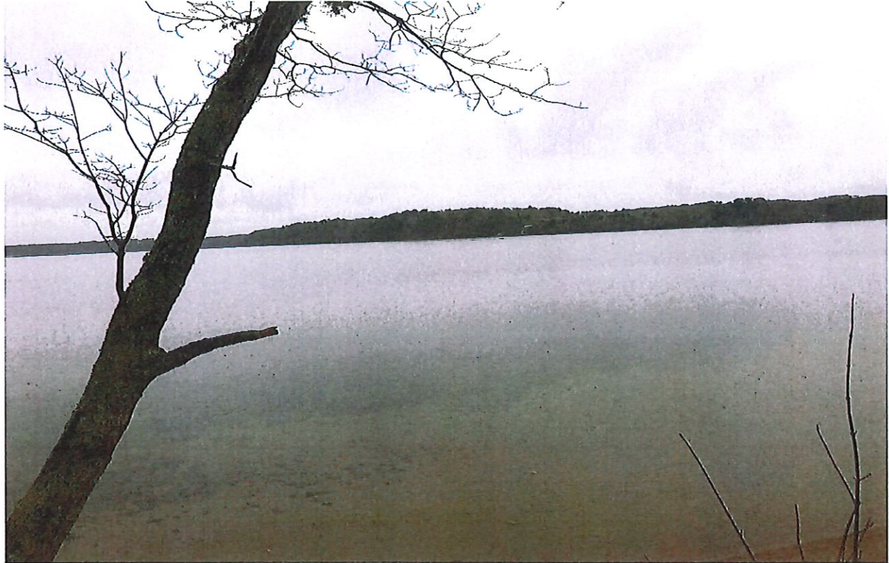
View of pond from Beach