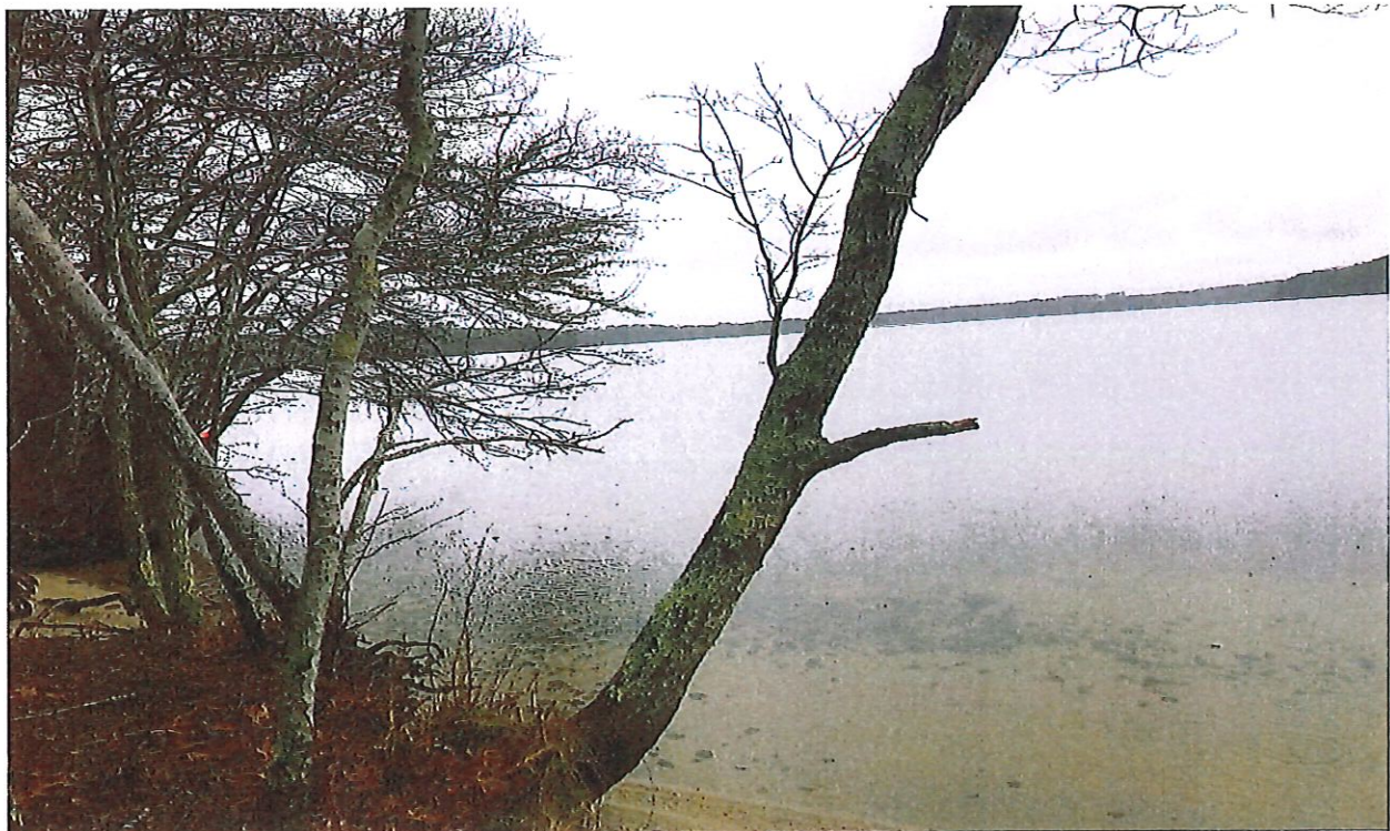
View to the west of Long Pond