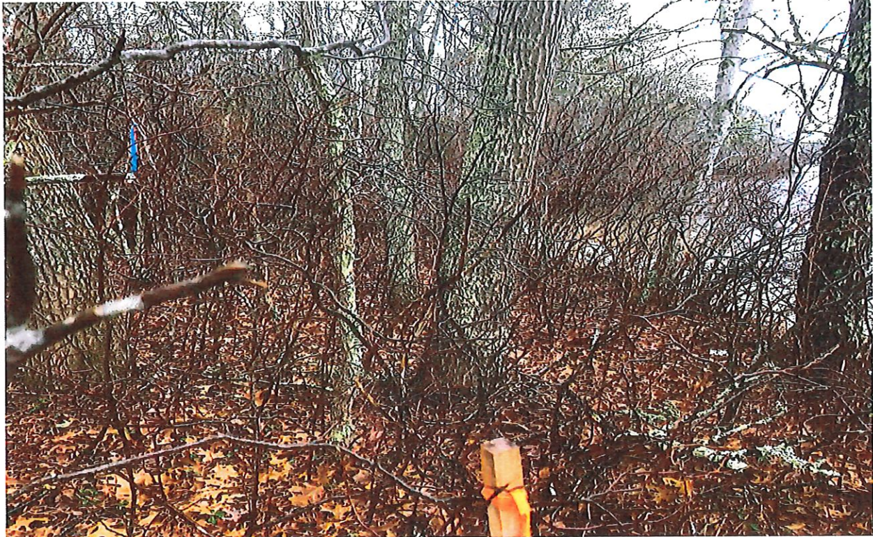
Vegetated Wetland along the Pond