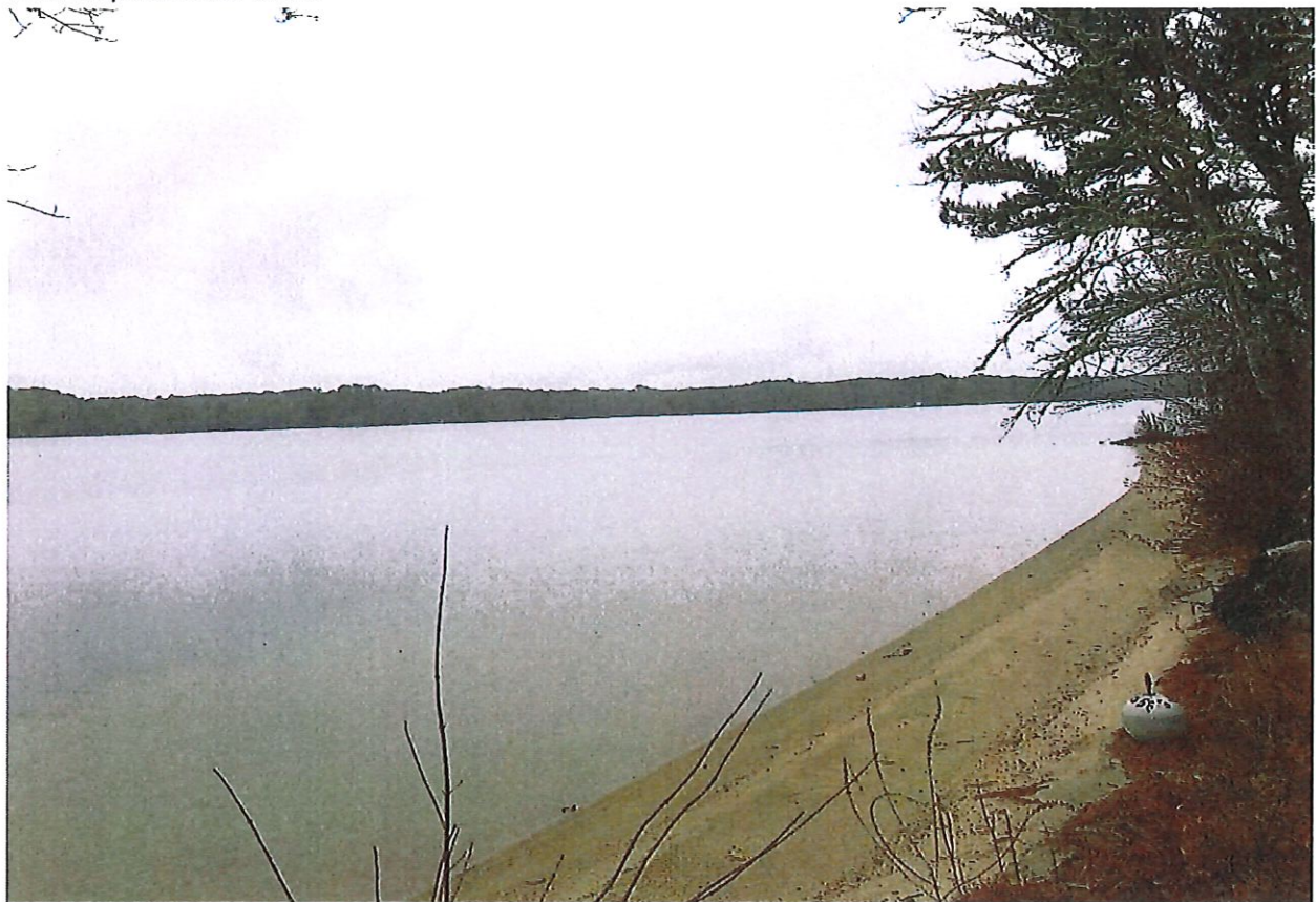
View to the east of Long Pond

Allen Seasonal Dock 18 Capt. Todd Way Harwich, MA