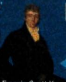
Francis Scott Key