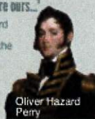
Oliver Hazard Perry

Master Commandant Oliver Hazard Perry uttered this famous phrase during the Battle of Lake Erie off the coast of Ohio. One of the largest battles of the war, 10 U.S. Navy vessels captured six British vessels, securing American control of the Northwest Territory.