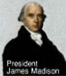
President James Madison

Congress and President James Madison supported a declaration of war against England. While our young nation may have been underprepared for war, we had a capable Navy including six exceptional frigates, U.S. merchant men who volunteered for service, and outstanding Naval leaders.