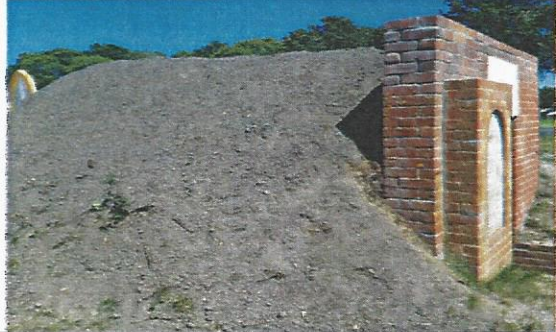
Captain Isaac Bee Crypt Mount Pleasant Cemetery 1850