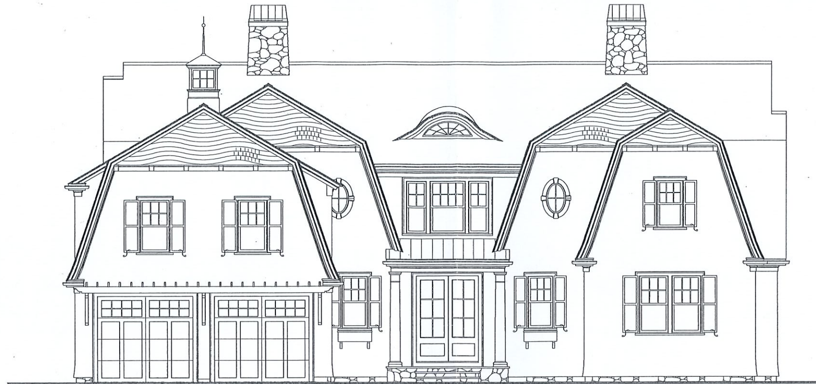
FRONT/NORTH ELEVATION SCALE: 1/4" = 1'-0"