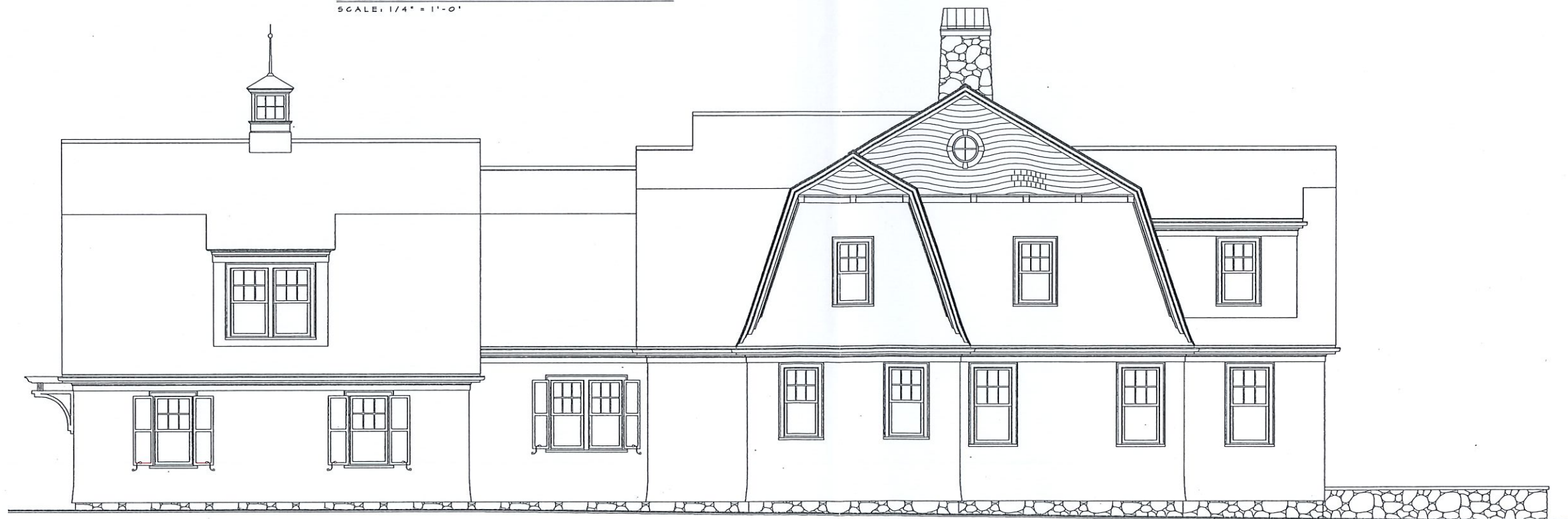
RIGHT/WEST ELEVATION SCALE: 1/4" = 1'-0"

RECEIVED TOWN CLERK HARWICH, MA 2023 JAN 27 P 2:37