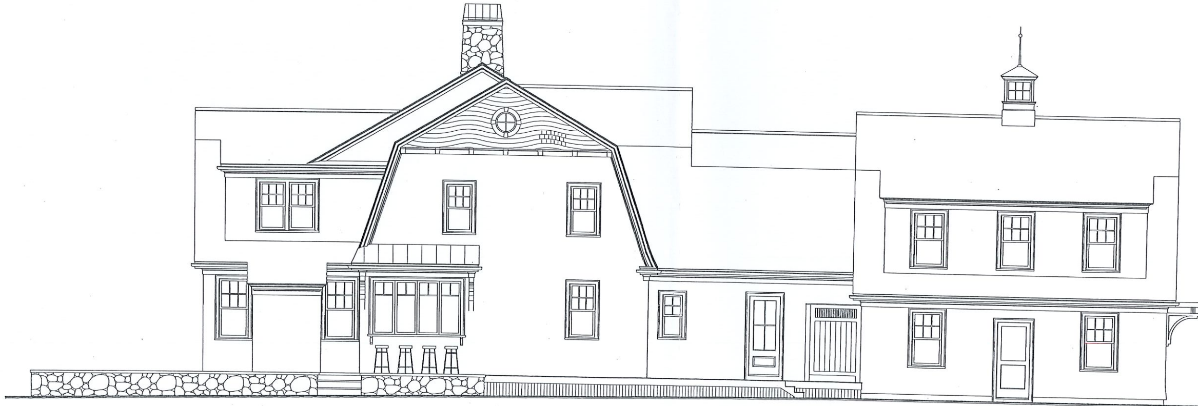
LEFT/EAST ELEVATION SCALE: 1/4" = 1'-0"

RECEIVED TOWN CLERK HARWICH, MA 2023 JAN 27 P 2:37