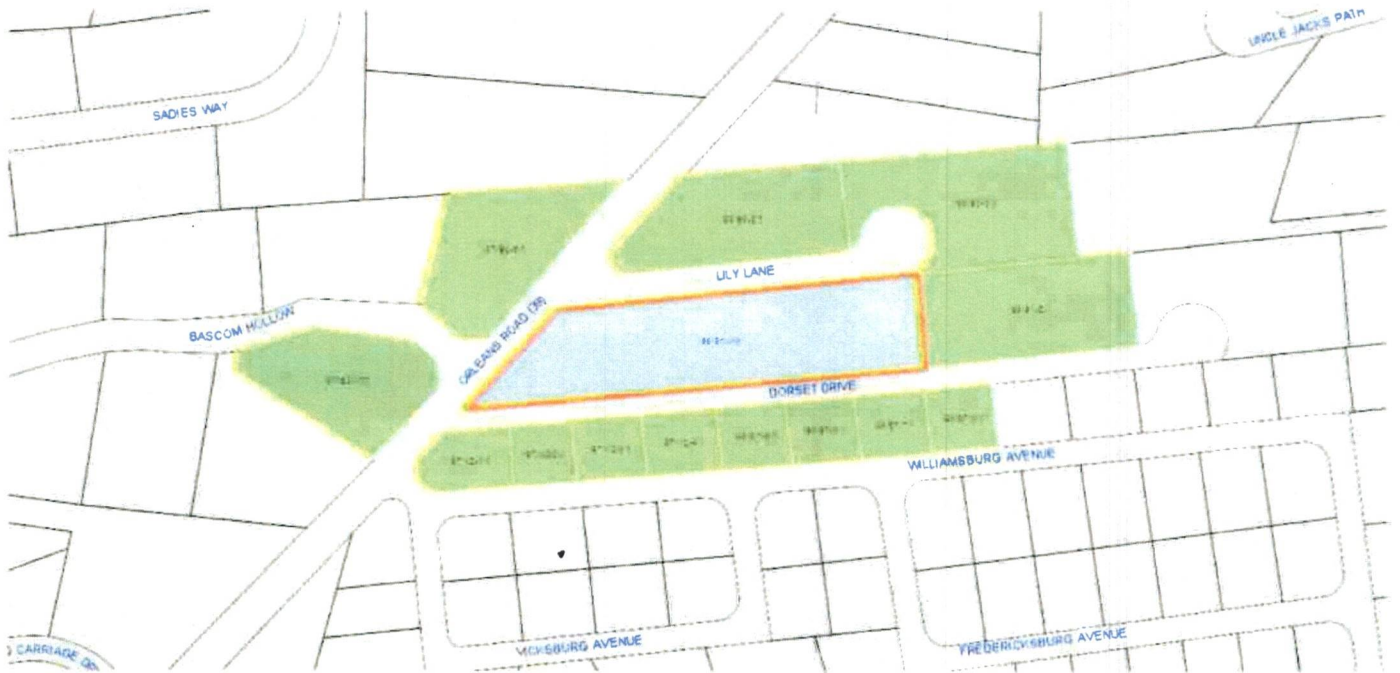
Town of HARWICH Abutters Within 50 feet of Parcel 98/B1-1/0