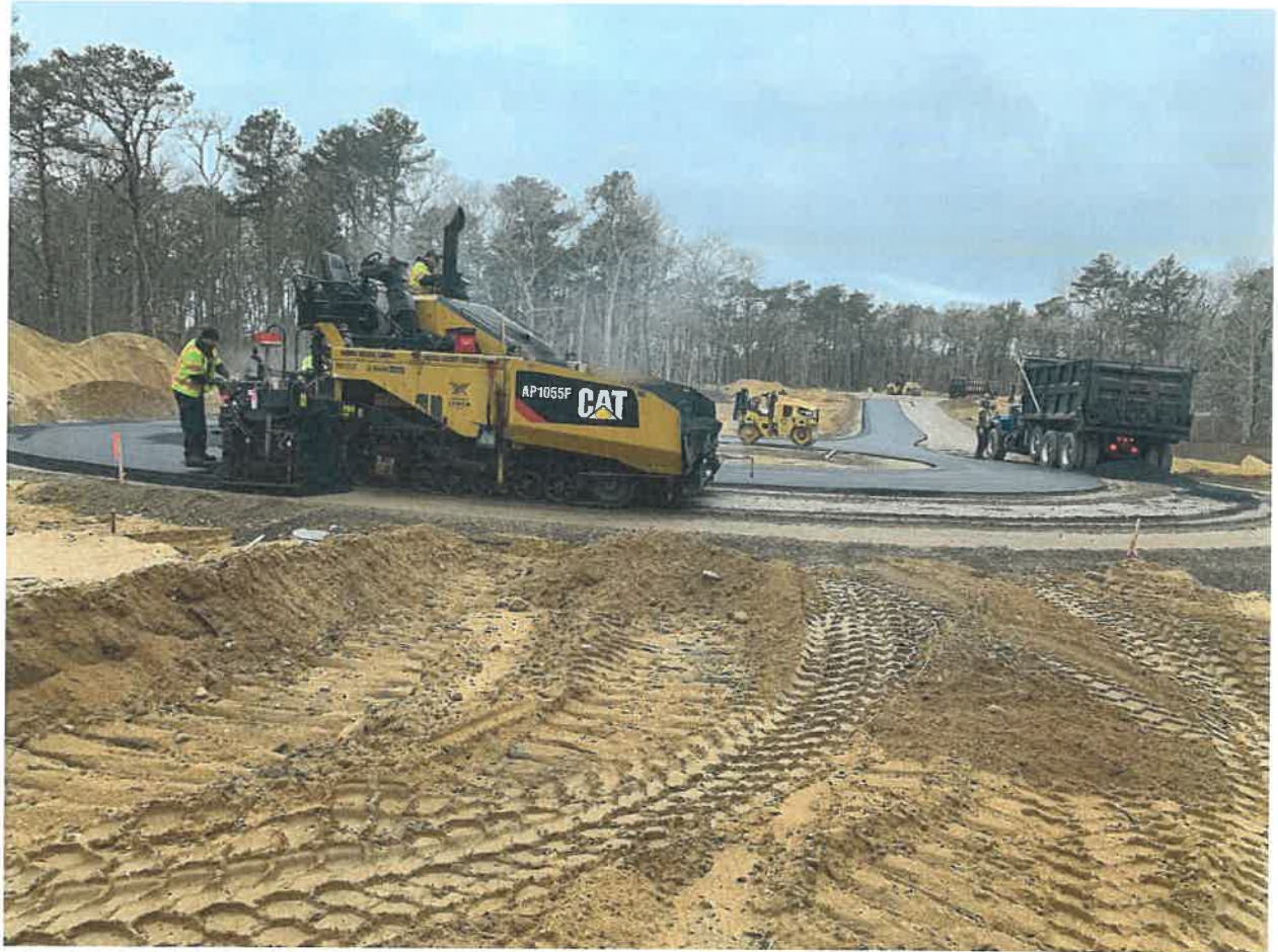
Inspection Date 12/30/2021