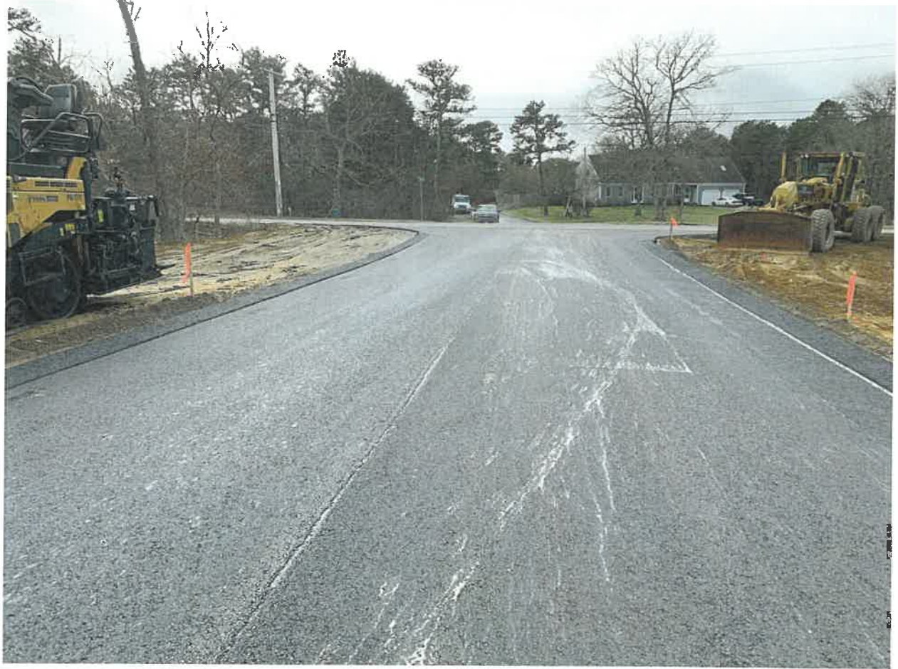
Inspection Date 12/30/2021