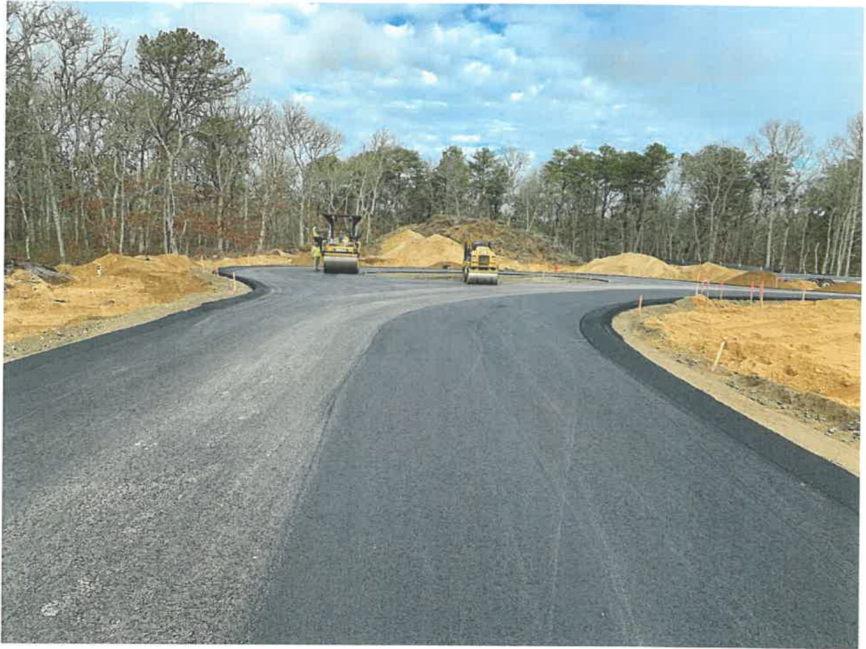
Inspection Date 12/30/2021