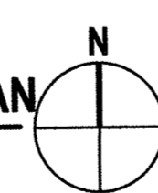
PUMPING STATION - PLAN SCALE 1" = 20'